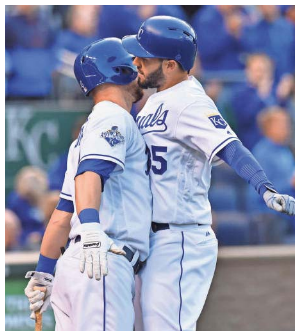
Kansas City Royals teammates Eric Hosmer, right, and Alex Gordon bump chests to celebrate Hosmer's go-ahead home run in the third inning Tuesday at Kauffman Stadium.